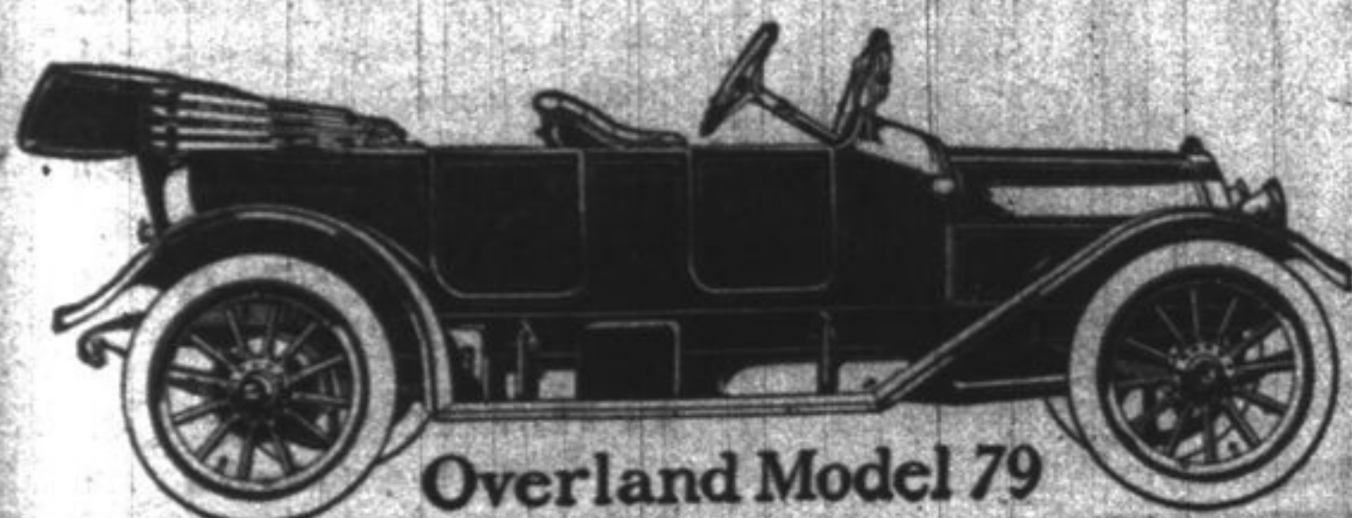
Overland Model 79