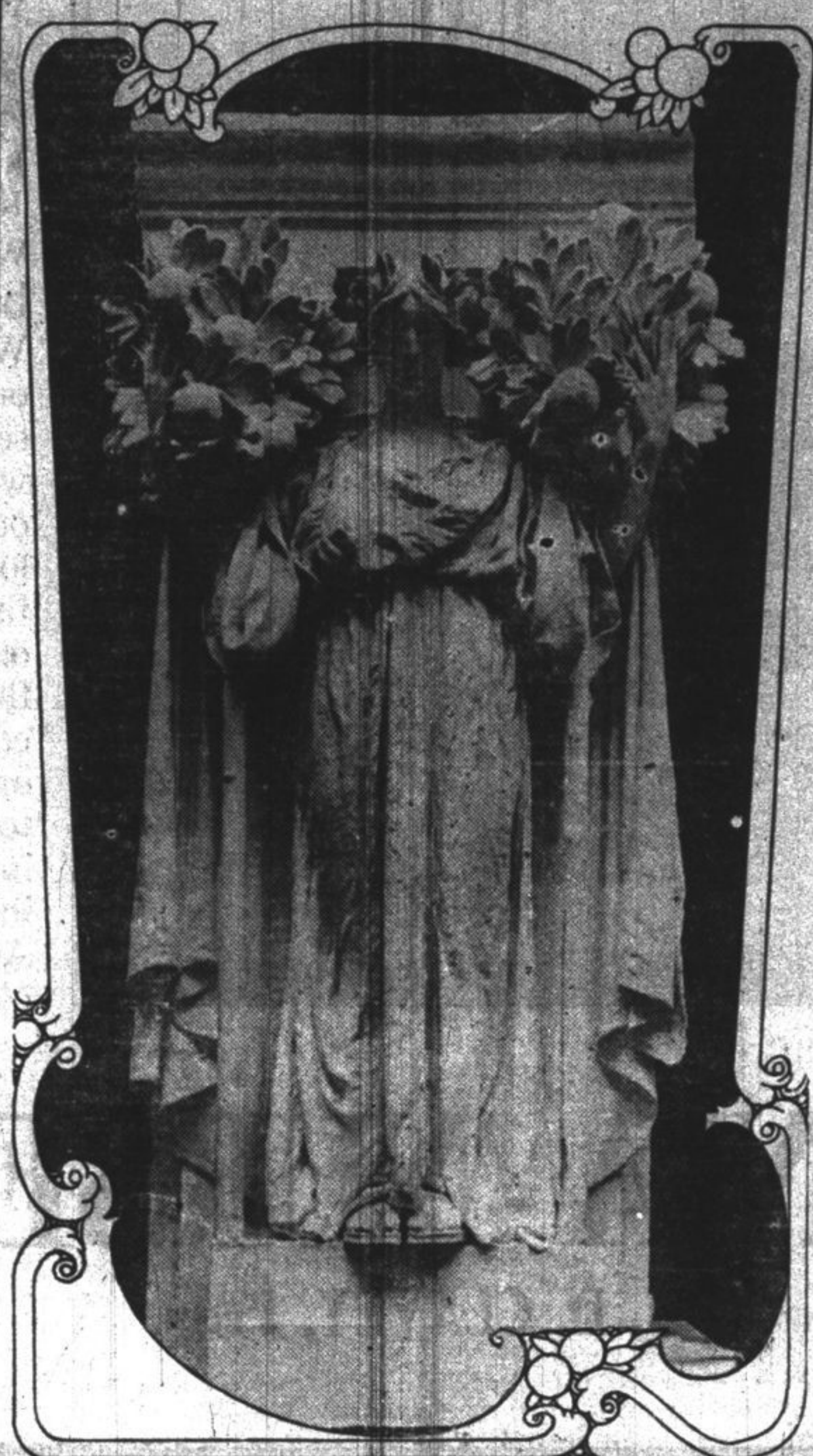
CLASSICAL FIGURE FOR GREAT EXPOSITION COURT, PANAMA-PACIFIC INTERNATIONAL EXPOSITION, 1915.