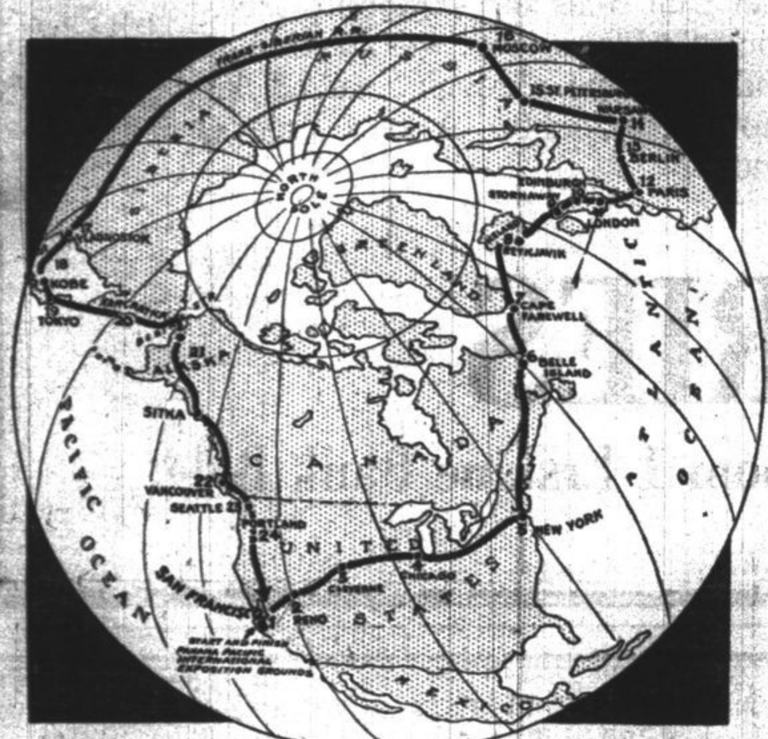
AIRSHIPS WILL RACE AROUND THE GLOBE FROM SAN FRANCISCO IN 1915.

Every phase of the exposition is far advanced. Thirty-three of the world's nations will participate with government displays, Argentina leading with a government appropriation of $1,300,000 gold.