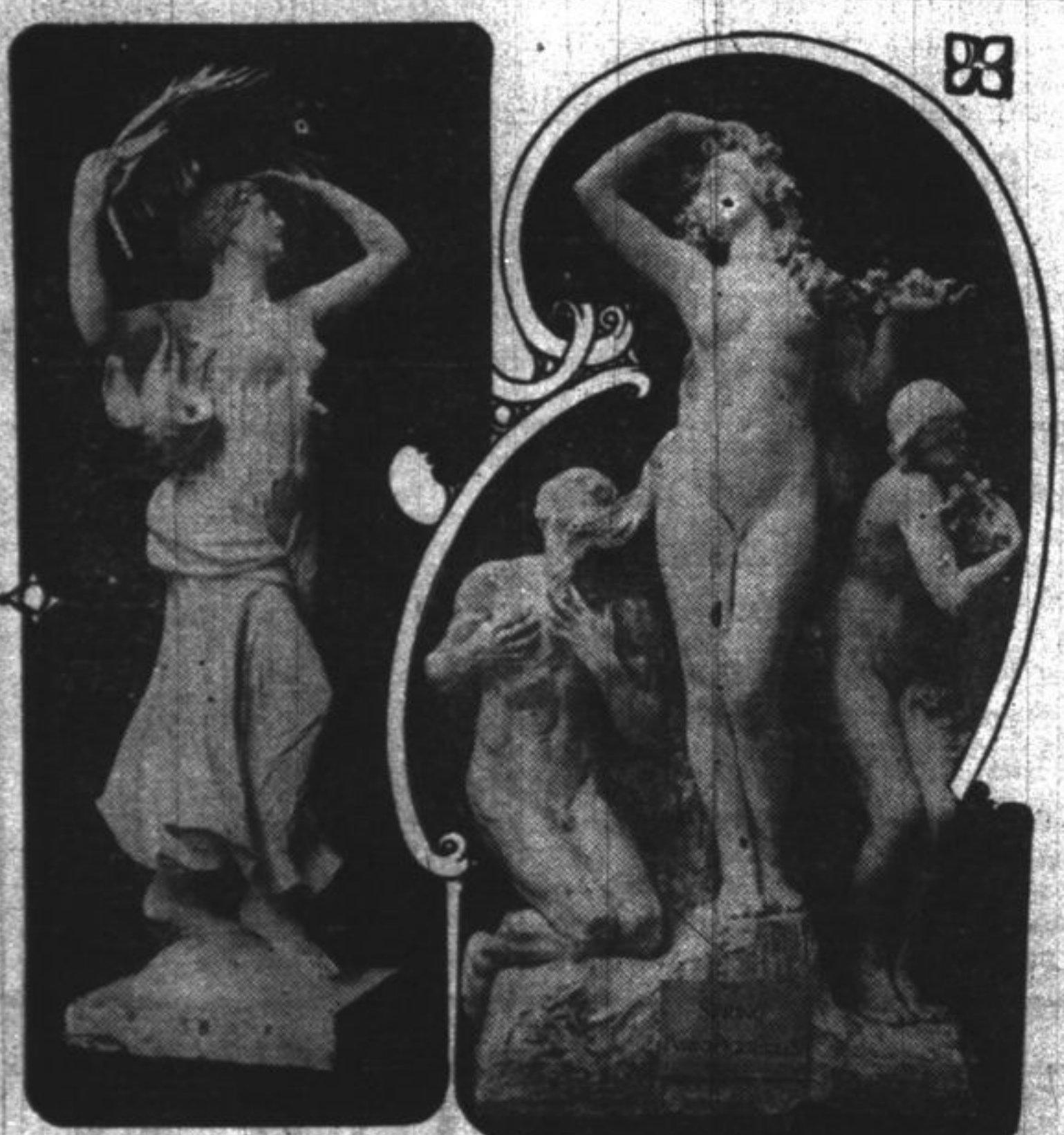
"SUNSHINE" AND "SPRING" AT THE PANAMA-PACIFIC INTERNATIONAL EXPOSITION, SAN FRANCISCO, 1915.

A ERONAUTS from all the civilized nations of the globe with every standard type of air craft driven by motors will participate in an aerial race around the world, which will be a feature of the sporting events to be held during the Panama-Pacific International Exposition at San Francisco in 1915. The race will start from the grounds of the Exposition in May, 1915, and will end there. Three hundred thousand dollars has been hung up in prizes for this stupendous world girdling contest. A number of the world's greatest aviators have signified their intention of entering the races. The recent flight of Stoeffler, ending at Mulhausen, Germany, in which he covered 1,375 miles, convinces aviators that long flights are a matter of adequate supply stations. The above photograph shows the route around the world and the various supply stations.