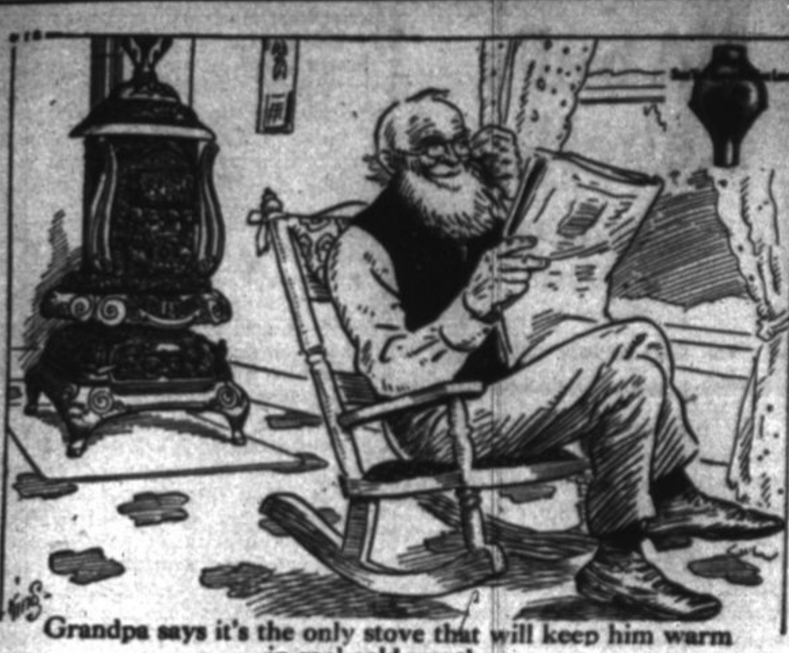
Grandpa says it's the only stove that will keep him warm in real cold weather