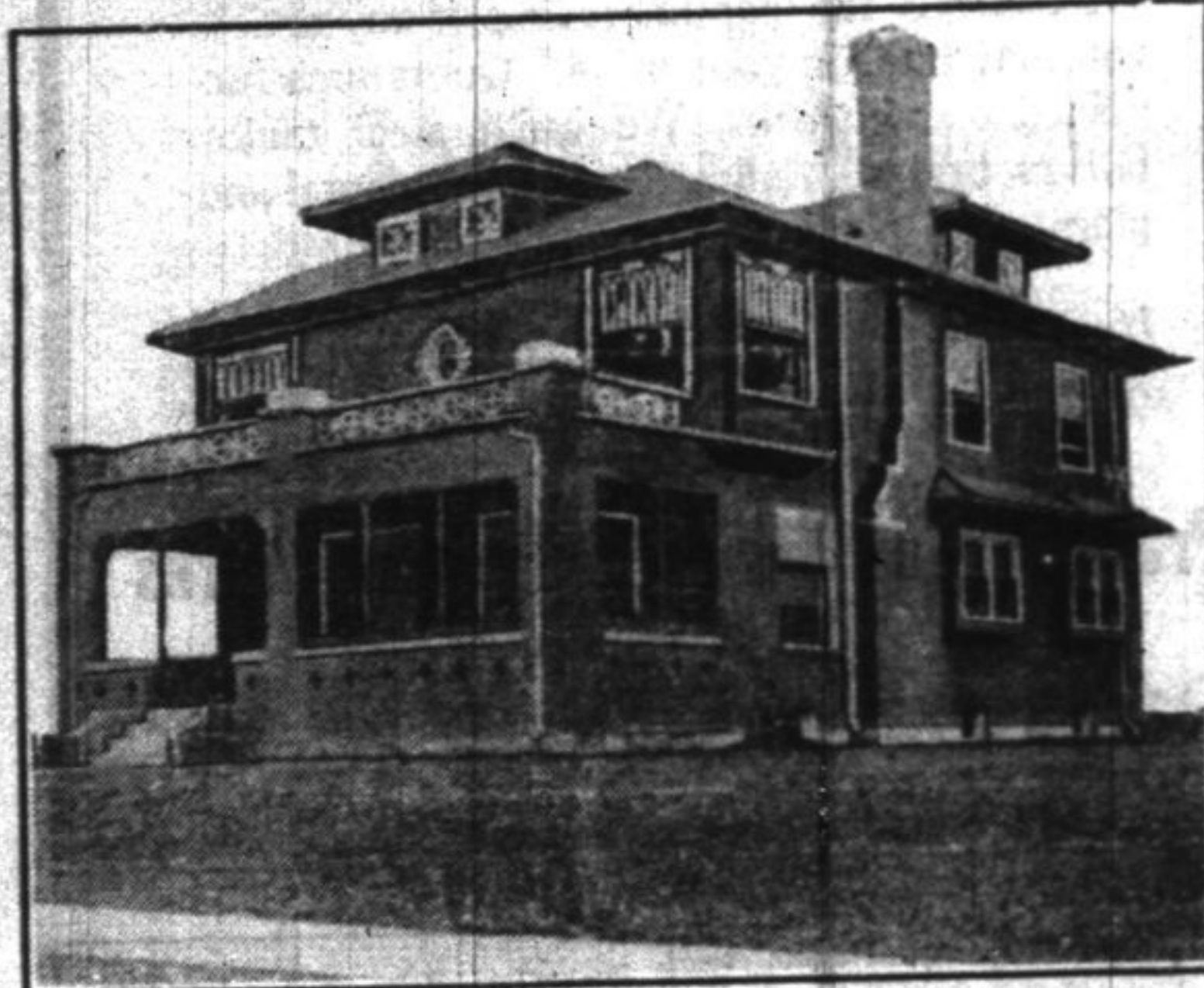
PERSPECTIVE VIEW—FROM A PHOTOGRAPH.