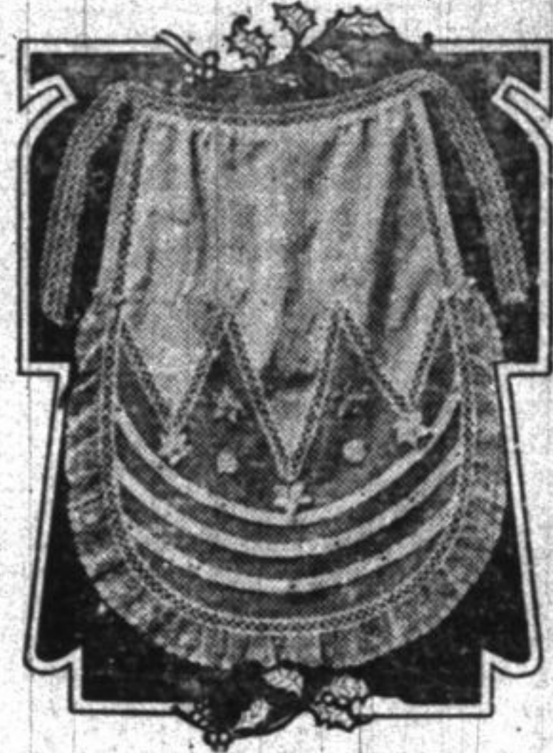
CHURNING DISH APRON.

Flue lawn was the material used in this case. It was cut in a single piece with the three points below, a handsome beading being run around the out-