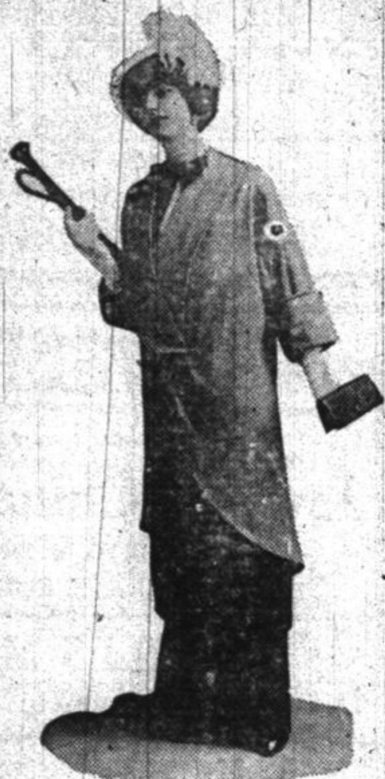
NEW MODEL IN COVERT CLOTH.

Three-quarter Lengths Are the Fall Fancy.