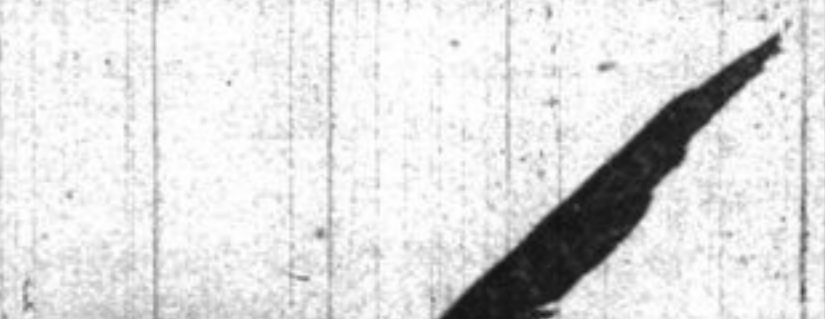
BLACK AND WHITE EFFECT.

No matter how hard the milliners try to evade the magic effect it looms up as dainty and attractive as ever at the beginning of each season. The model in the cut is but another in stance of this revival.