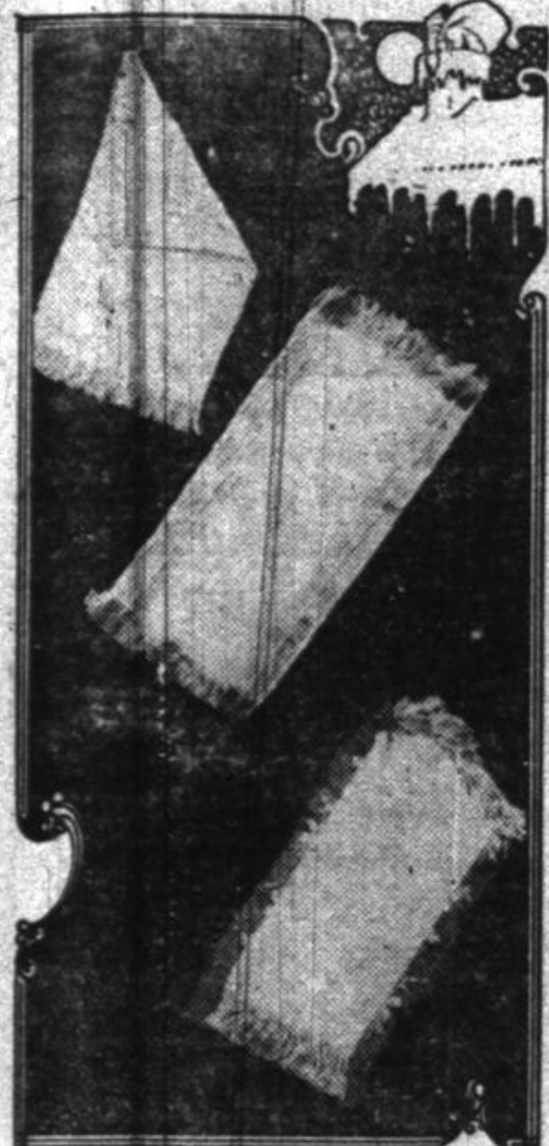
RIBBON POWDER BAGS.