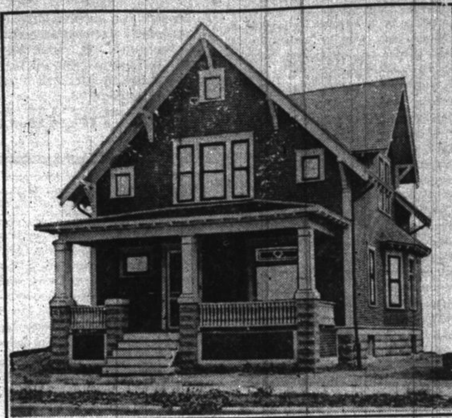
PERSPECTIVE VIEW—FROM A PHOTOGRAPH.