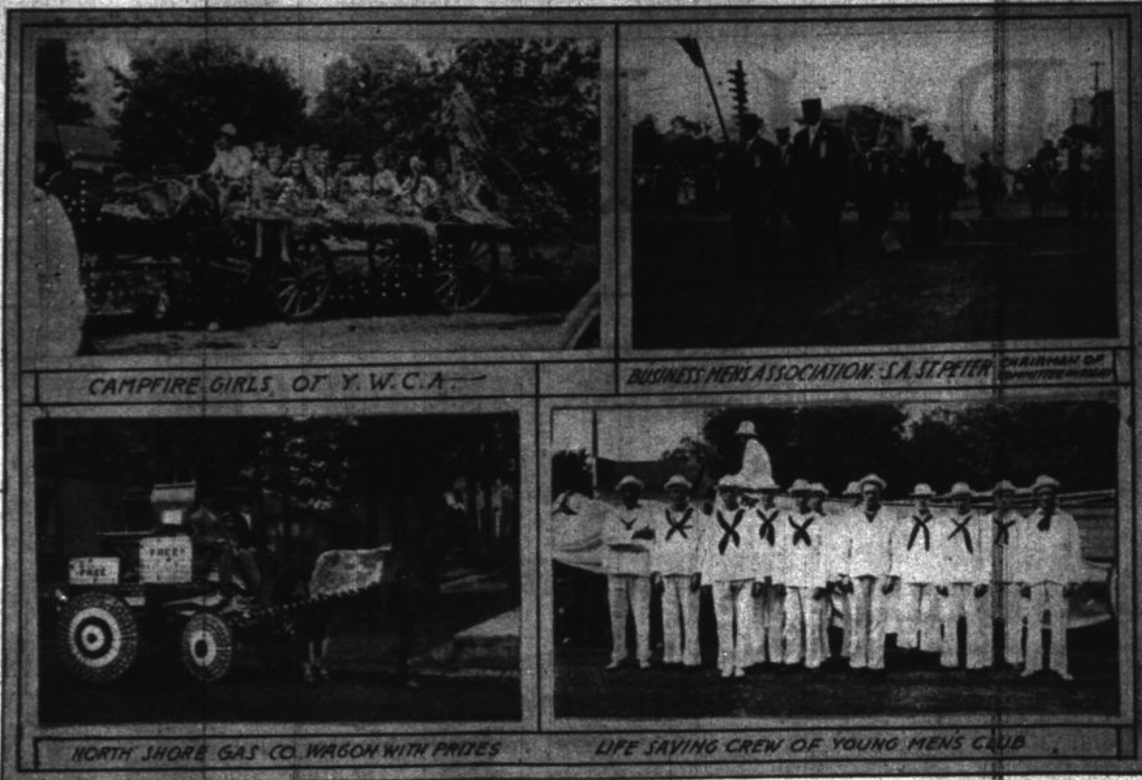
CAMPFIRE GIRLS OF Y.W.C.A.