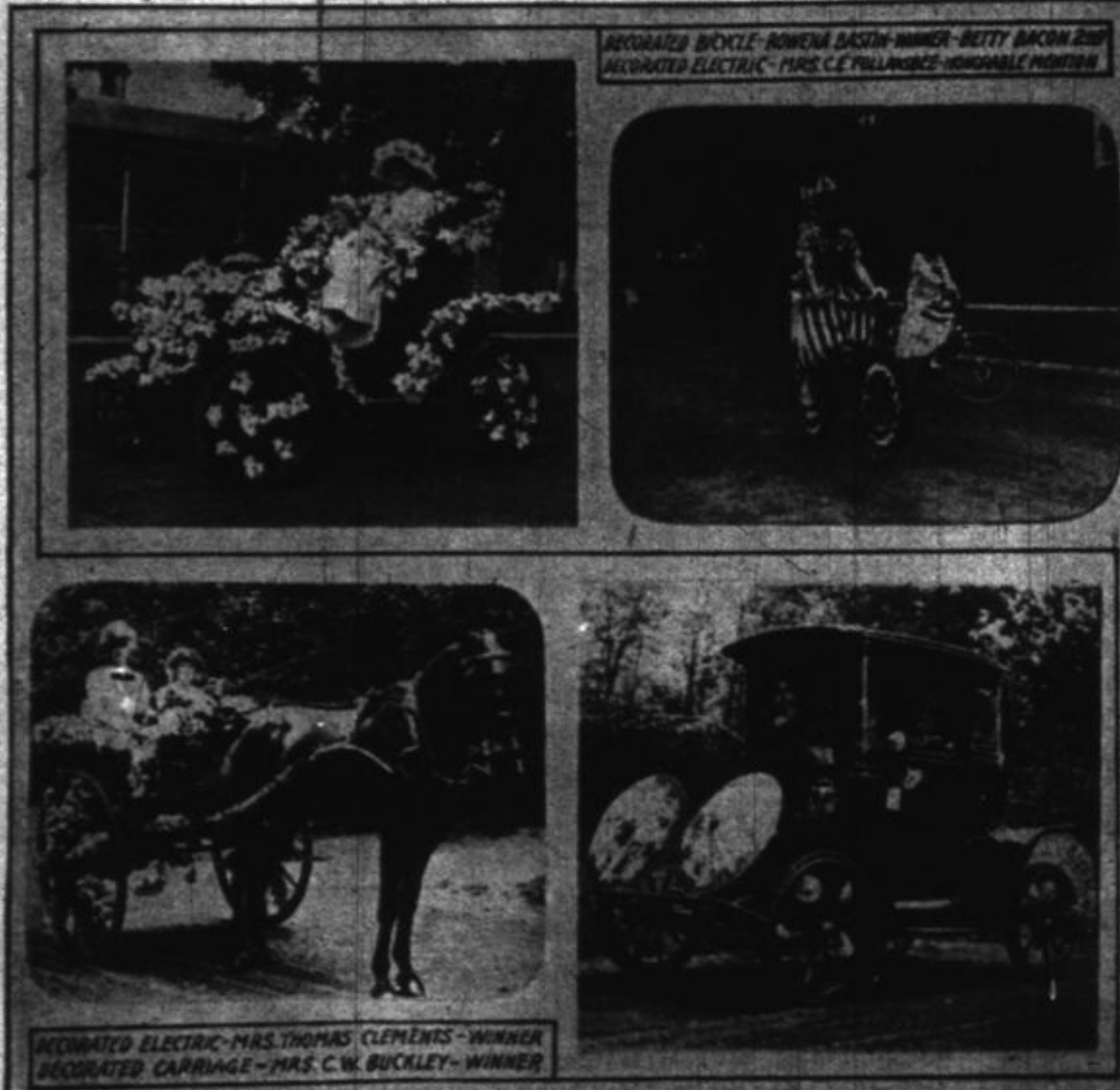
HIGHLAND PARK DAY VIEWS CONTINUED FROM FIRST PAGE

Skeletons For Doctors. The mode of preparing skeletons for the use of the medical profession is a very delicate operation.