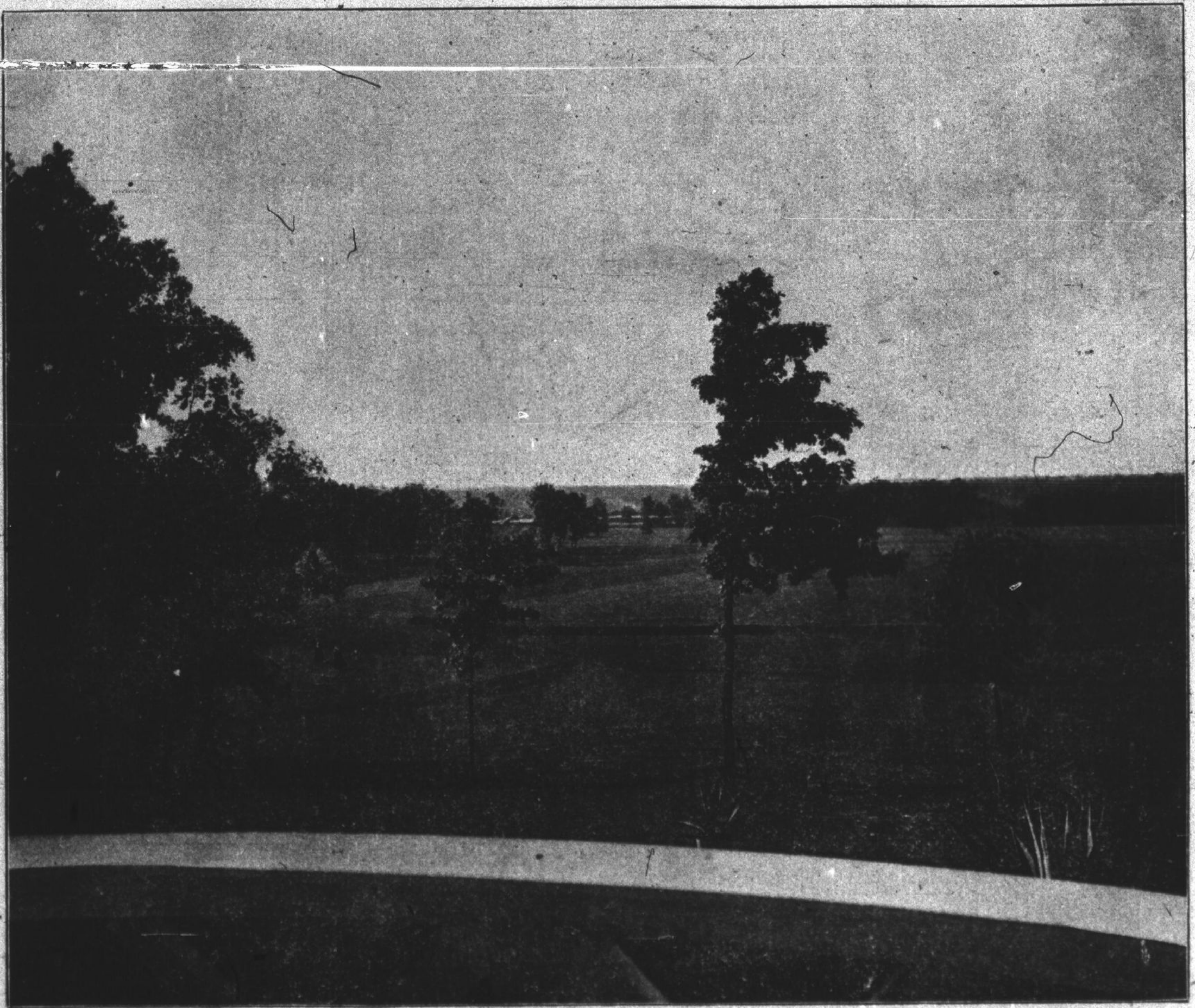
View of Golf Links, from Exmoor Country Club House, Highland Park.