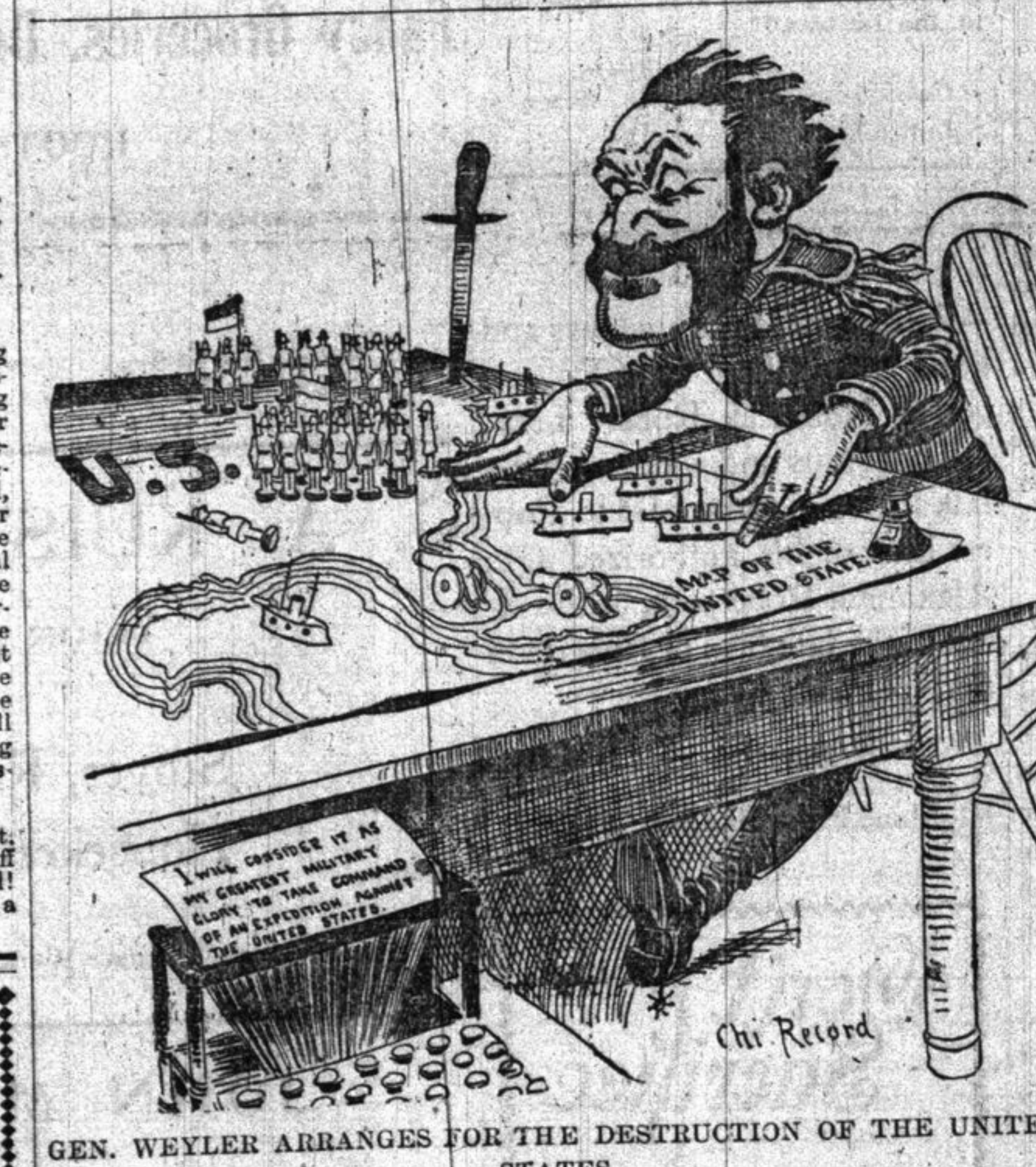
GEN. WEYLER ARRANGES FOR THE DESTRUCTION OF THE UNITED STATES.

A Piece of Spite Work. She frowned at him and called him Mr., Merely because he came and Kr. That very night, just her to spite, That naughty Mr. Kr. Sr.—Tit-Bits.