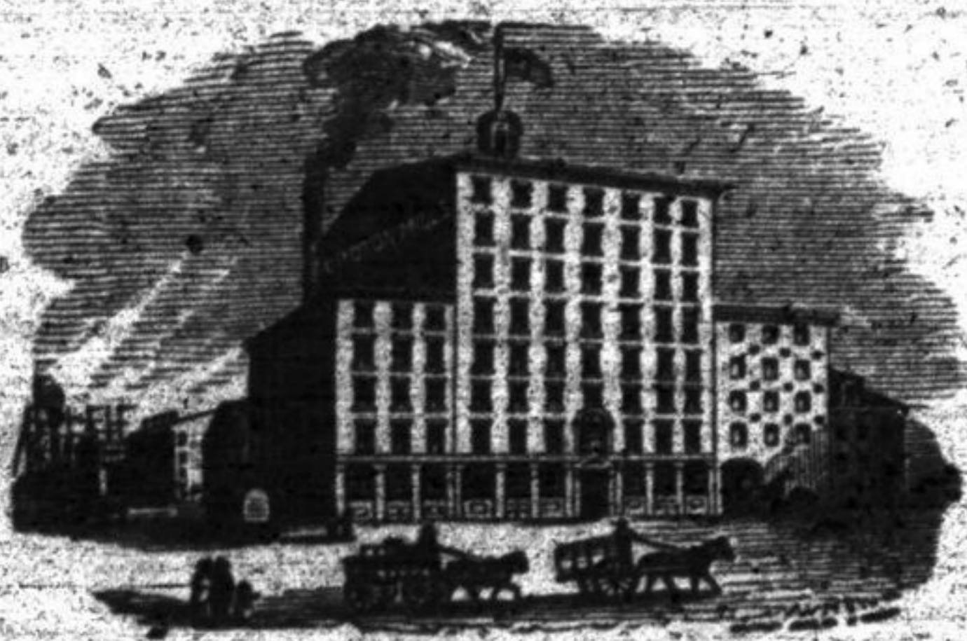
THE OLD MILL.