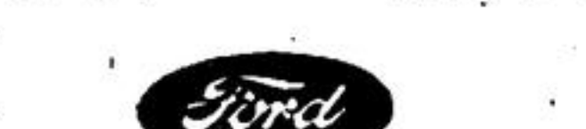
"The Canadian Car"