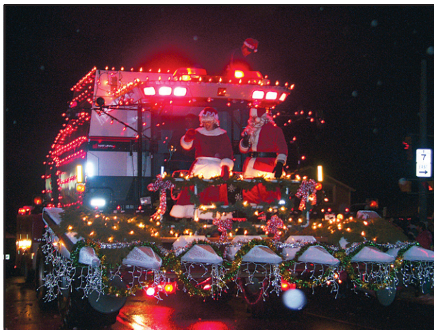
Most importantly, you will see Santa & Mts. Claus