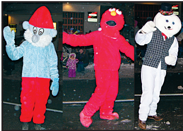
Seasonal characters will greet the crowds

Various village merchants will offer hot chocolate, along with the Rockwood Lions Club which will serve hot chocolate at the Fourth Line parade viewing location and Stone United Church will host a chilli/hot dog dinner at Rockmosa, prior to the parade.