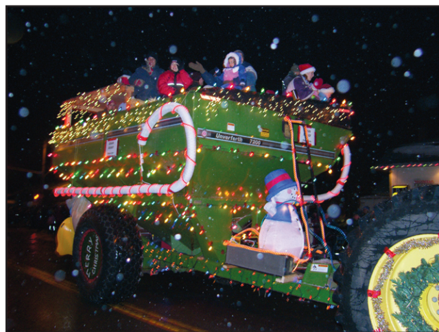
Farming equipment decked with Christmas spirit