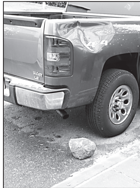
VEHICLE VANDALISM: This Chevy Silverado truck was one of several vehicles damaged overnight Saturday/Sunday in the Kingham Road-Highway 25 areas.