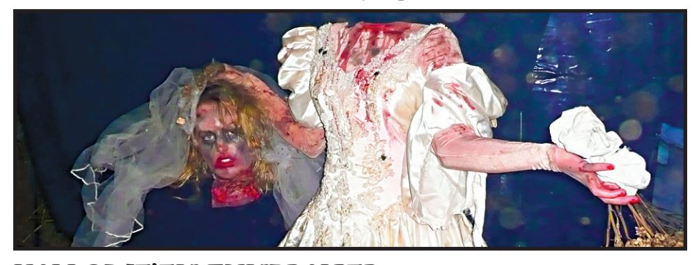
HALLOWE'EN FUNDRAISER: Ghoulish scenes – including this blushing bride – greeted visitors to the haunted house on Hurst Street on Hallowe'en where visitors donated items of non-perishable food to tour the scary lair.