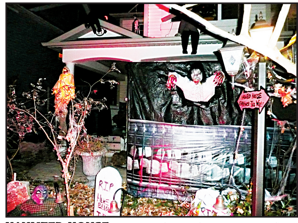
HAUNTED HOUSE: Hundreds of people flocked to a Hurst Street residence on Hallowe'en to tour a spooky haunted house. Visitors donated non-perishable food for Acton's FoodShare.