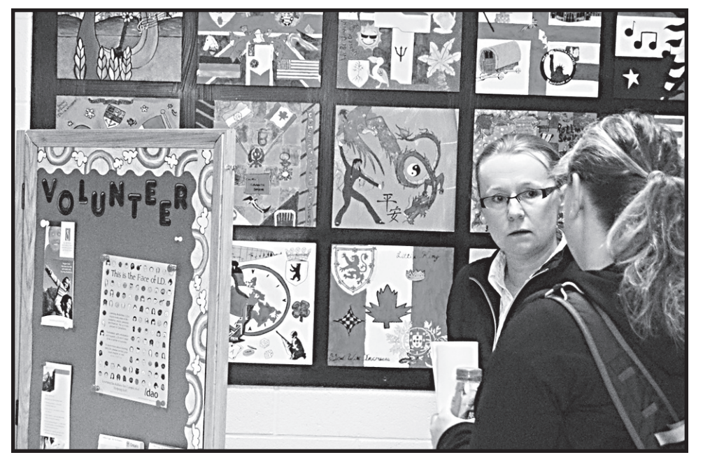
PIC INFORMATION: Acton parents and those from other parts of Halton networked, exchanged information and got tips from experts at the recent Halton District School Board's Parent Involvement Committee PIC) workshop in Milton.