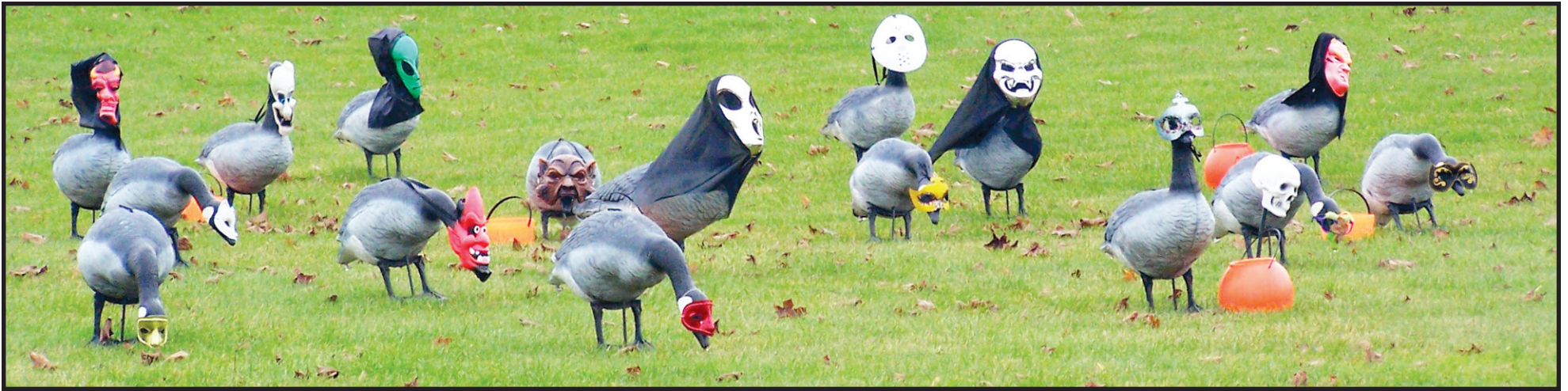
GHOULISH GEESE: this flock of scary trick or treaters outside Rockwood got their fill of Halloween treats and entertained passing motorists.