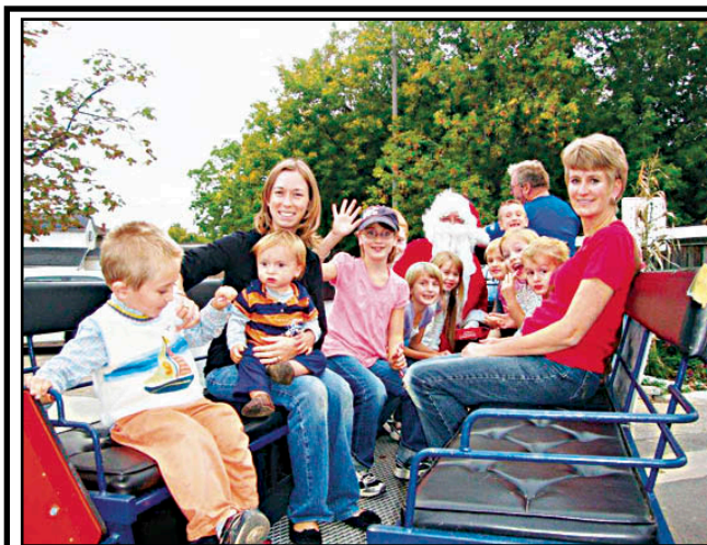
A LOT LIKE CHRISTMAS: Santa made an impromptu visit to the Acton Farmer's Market on Thursday afternoon as he invited children on horse-drawn carriage rides. Buyers and sellers shared the Christmas spirit early with decorations and colourful displays.