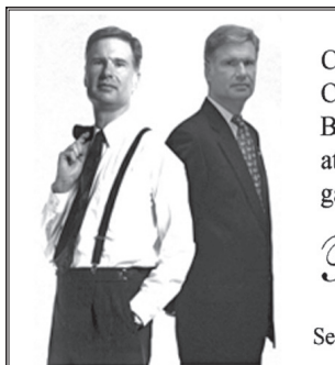
Where friends gather...

MacKinnon Family Funeral Home "Shoemaker Chapel" (519) 853-0350 or 1-877-421-9860 (toll free)