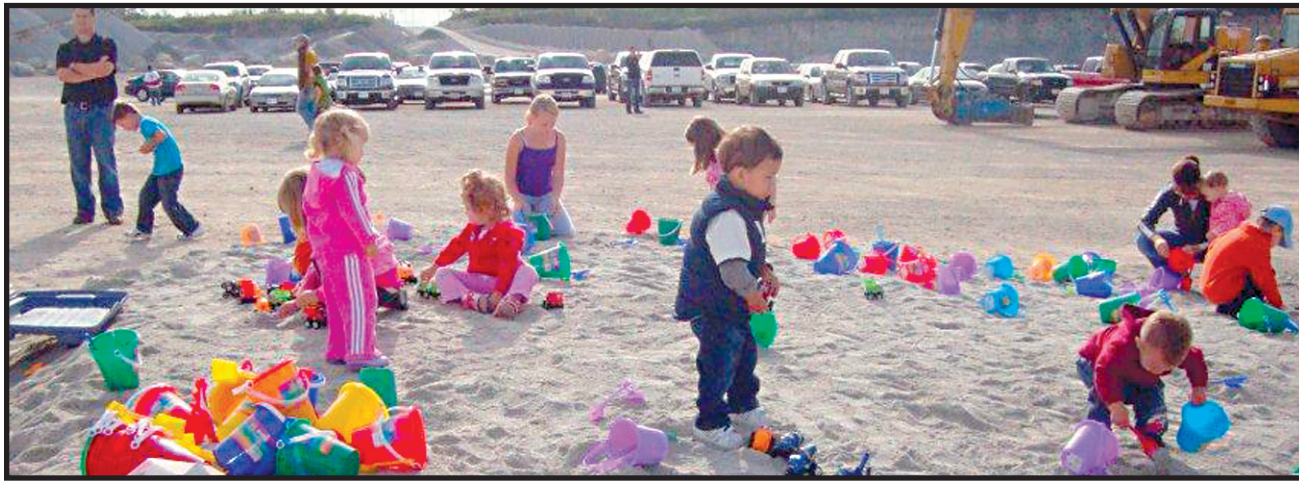
FUN AT THE QUARRY: Local families were treated to an open house hosted by Dufferin Aggregates Acton quarry on Saturday morning. The fun included complimentary rides on digging equipment, face-painting, and playing in the makeshift sand-pit.