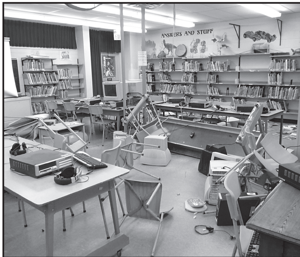
RANSACKED: Two Acton teens who plead guilty to charges of Break and Enter with Intent to Cause Mischief over $5,000 will be sentenced on October 28 after they speak with students and staff at the school in what has been described as a restorative justice meeting..