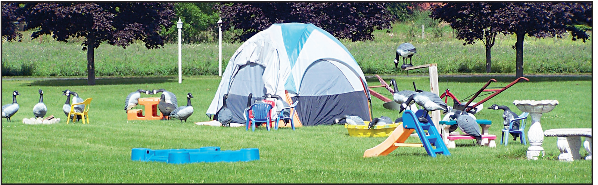
CARRY ON CAMPING: The geese on Highway 7 near Rockwood are using the last few weeks of summer to vacation with some summer camping.