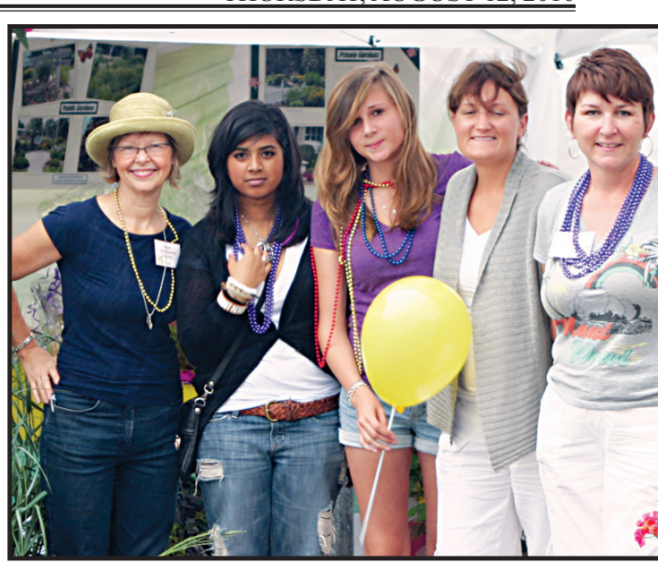
LOVELY LADIES: These five green thumbs were on ha promote the Acton Horticultural Society.