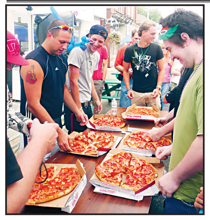
pizza awaited the person who could inhale the most pizza slices.