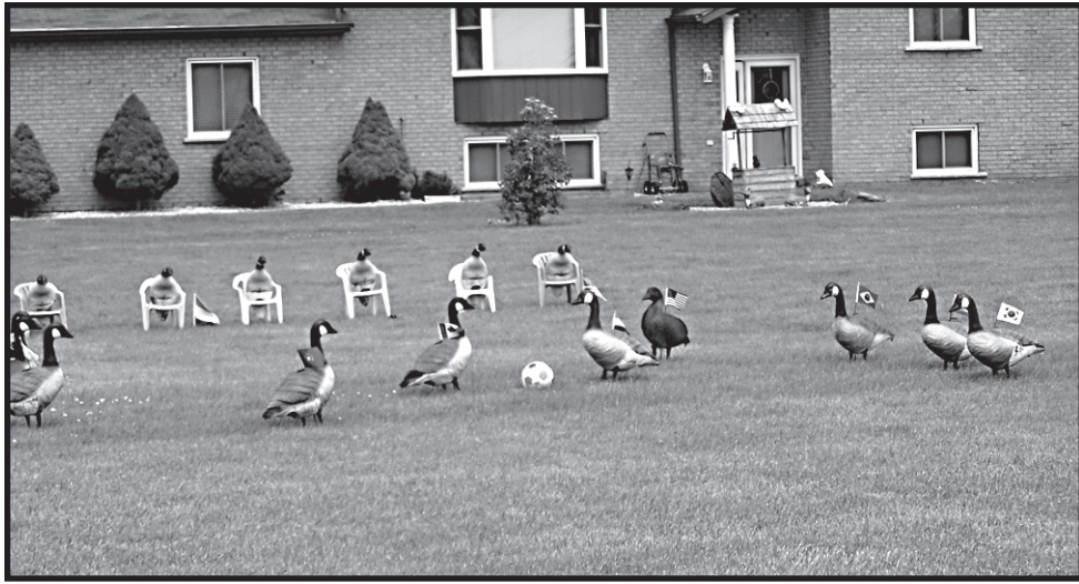
FIFA FLOCK: Not to be outdone by the games being played in South Africa, the Rockwood geese faced off in a past paced soccer game recently.