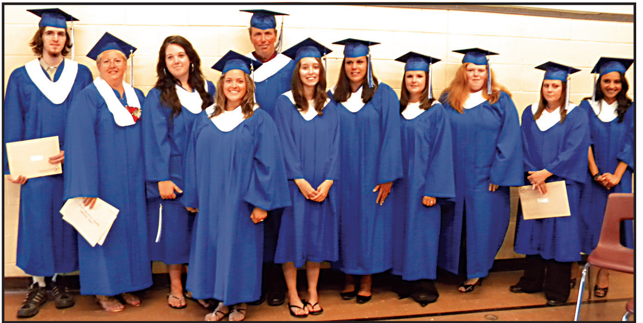
GREAT GRADS: These graduates were among the 63 students who were honoured at the Gary Allan High School graduation and awards ceremony last week in Georgetown.

staff filled the gym as everyone shared in the excitement of the celebration. Each well-earned diploma not only recognized the hard work of the individual, but reflected the support and encouragement that family and friends provided. Along with the diplomas, many students were also honoured with awards that were made possible by individual donations, donations from the Kiwanis Club of Georgetown, the Georgetown Lions Club, and a monetary award from the Halton Learning Foundation. The awards recognized academic achievement, perseverance, leadership and the significant contribution of individuals to the Gary Allan High School community.