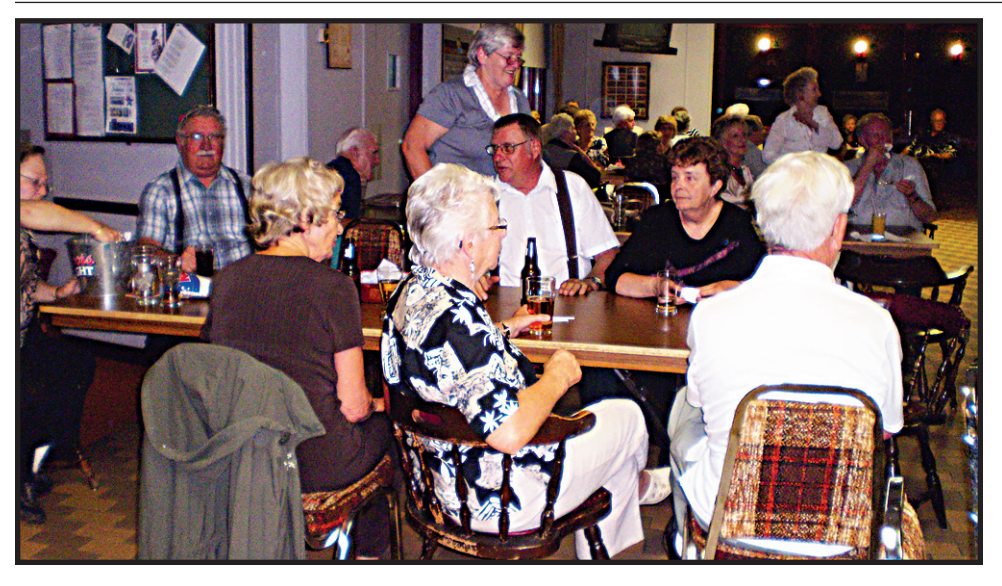
SENIORS' FUN: Some members of the Acton Seniors Centre took a well-deserved break after dancing up a storm at the Acton Legion last Friday.

THURSDAY, JUNE 10, 2010 THE NEW TANNER 17