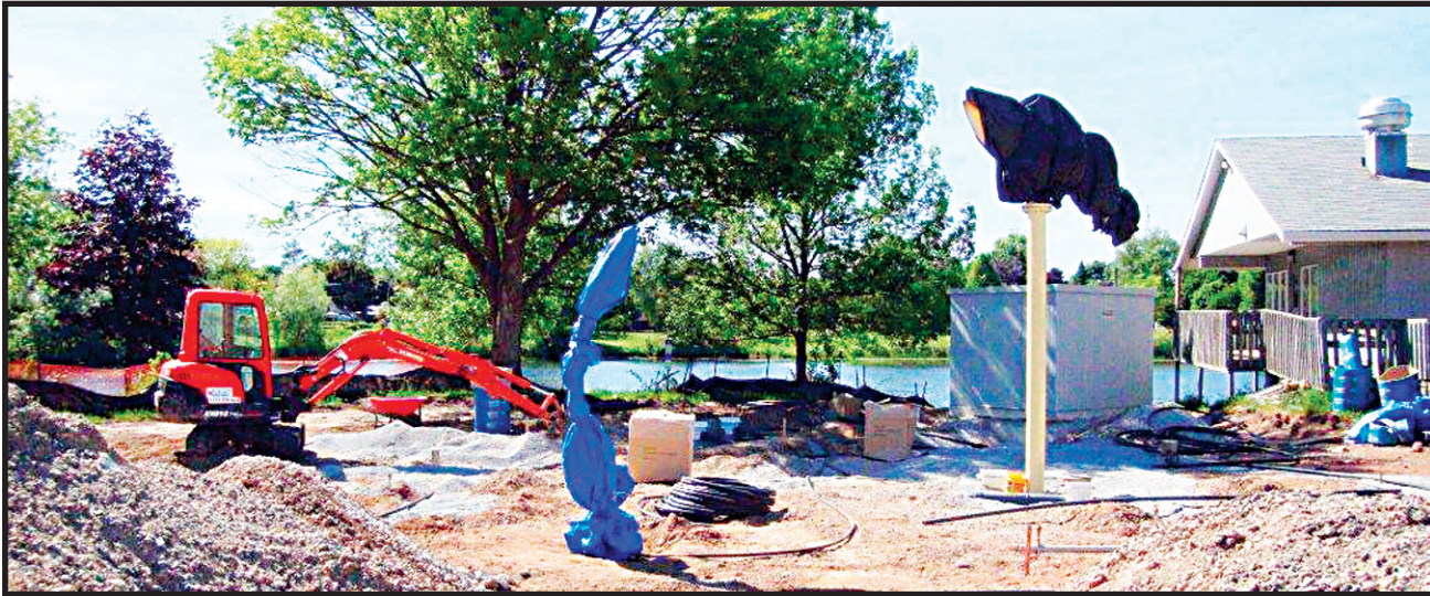
COMING SOON: Work is progressing smoothly on the splash pad in Prospect Park – heading for a July opening.