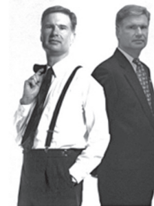
Where friends gather...

Casual to Formal Conventional or Unconventional Blue Springs is a comfortable atmosphere where friends can gather.