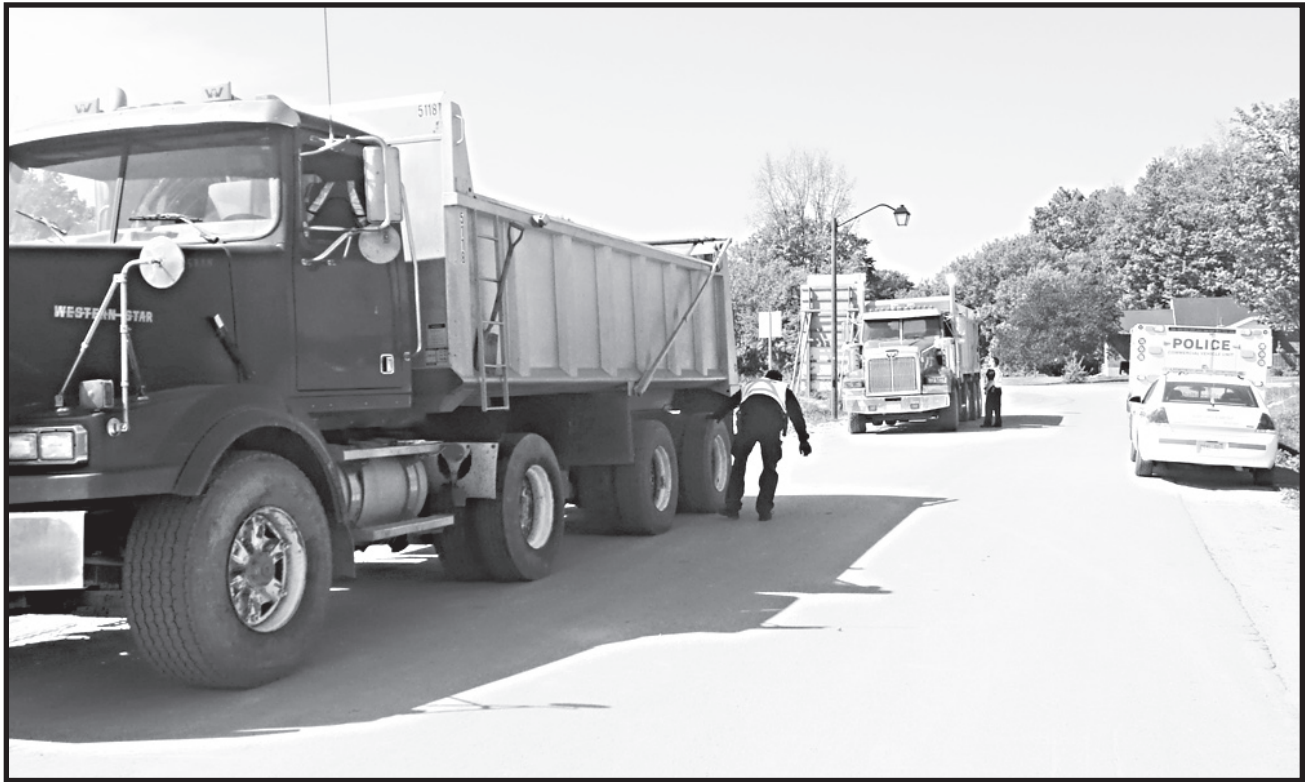
SAFETY BLITZ: Halton police and the Ministry of Transportation carried out a safety blitz last Wednesday on Highway 25, just south of an Erin property where a steady stream of dump trucks continue to dump clean fill.

Another great way to cool off is to visit the Acton Indoor Pool for daily recreational swimming. For the pool schedules call the Acton Pool at 519-853-3140.