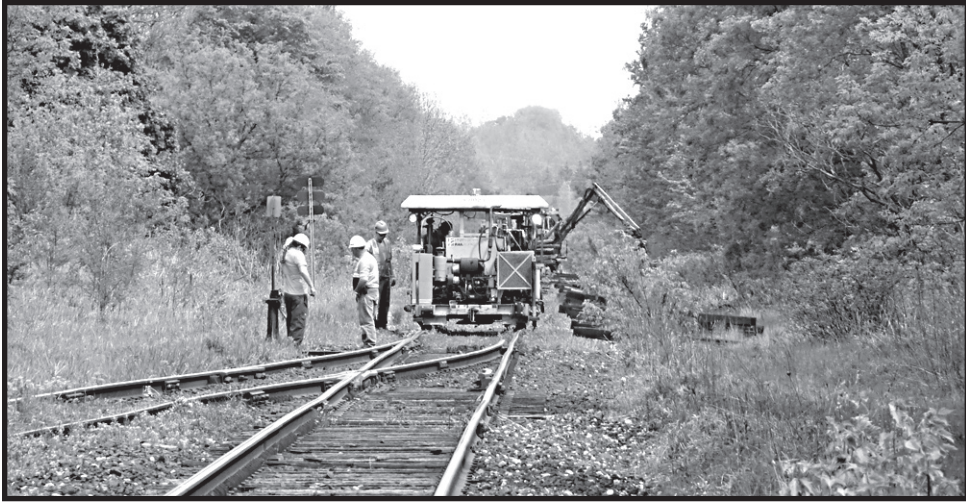
NEW TIES: The traffic delays at Acton's rail crossings earlier this week were caused by crews replacing approximately 500 railway ties in a five-kilometre stretch of the Goderich Exeter line that runs through town.