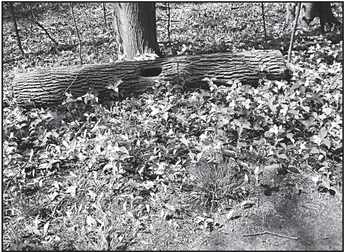
TRILLIUM TREATS: While hiking in the Limehouse area recently, members of the Acton Seniors Hiking Group were pleased to see that the Trilliums were in full bloom.

During the evening, visitors are invited to see an exhibit of stories, poems and poster board displays of students of all grades.