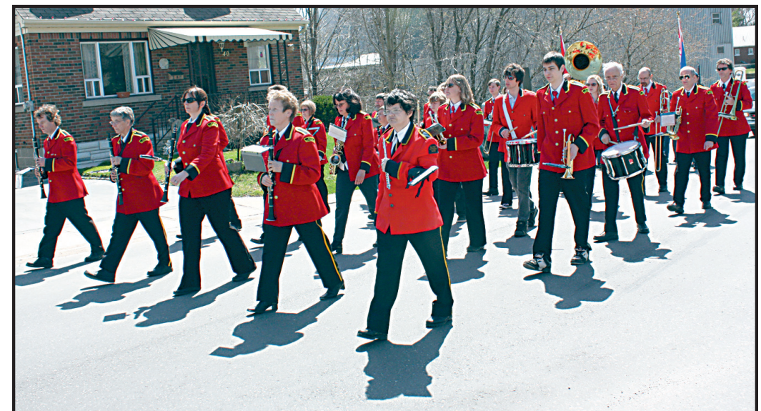
CITIZENS' BAND: The Acton Citizens' Band participated in the parade from the Legion to the cenotaph as part of the scheduled events celebrating the District B Zone Convention held at the Acton Legion last weekend.