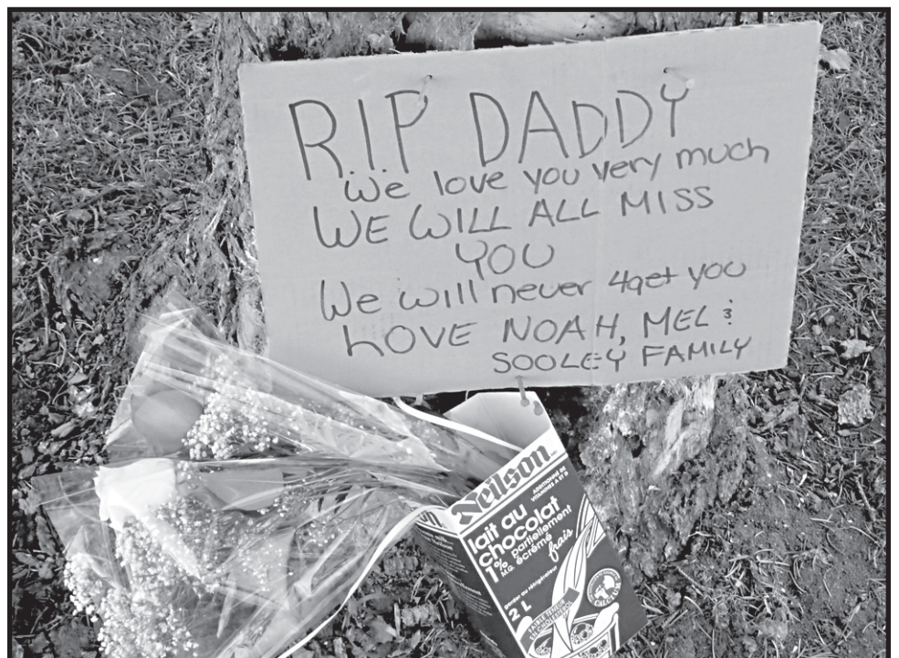
REST IN PEACE: The former girlfriend of the 22-year-old Mississauga man killed in a single car crash in Acton early Saturday morning placed flowers and a sign at the accident scene on Monday afternoon. The sign reads "RIP Daddy" – the dead man had a nine-month old son. The police investigation into the accident that also injured five people continues.

The ESQUESING HISTORICAL SOCIETY presents