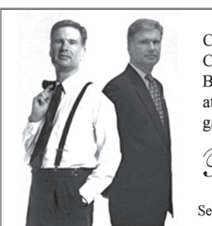
Where friends gather...