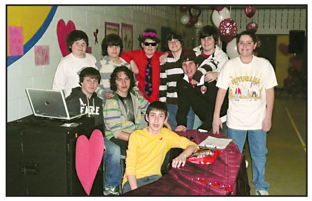
TUNE TEAM: These Grade eight students at St. Joseph's Catholic School set the scene for a dance-a-thon, the school's major fundraiser, last Friday.

To commemorate future employee appreciation events, an exciting art contest for Halton District School Board students and staff entitled, "Learn, Grow, Succeed...Together," is being launched. The winning piece will be chosen in the spring.