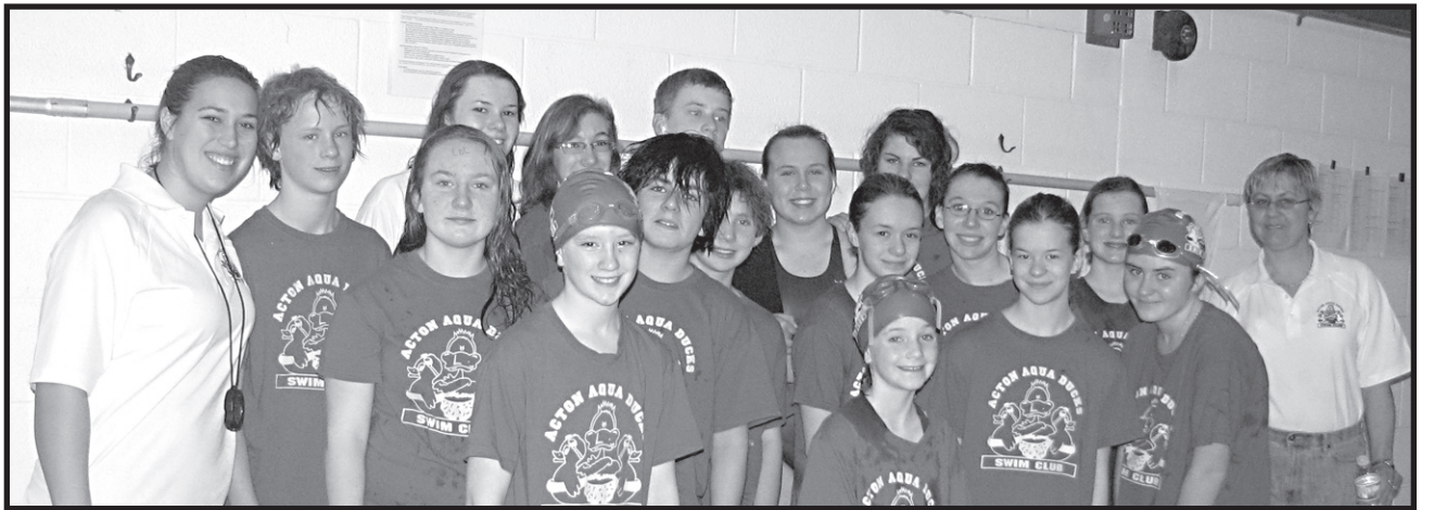
DUCKS MAKE A SPLASH: First place finishes and personal bests were wracked up by members of the Acton Aqua Ducks swim club at a recent meet in Scarborough.