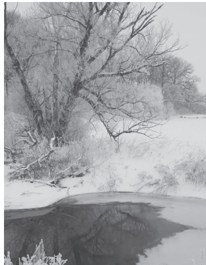
Open water does not always appear when ice is thin.

Ice on area ponds and lakes and in particular, Fairy Lake is still too thin for people to venture onto and children and adults, need to pay attention to the signs and warnings about staying off the ice. A very popular spot for the venturous, Fairy Lake has a number of open-water areas for the waterfowl and the dam, making a number of locations very dangerous. This past weekend, the Peterborough area investigated the death of at least one snowmobiler who plunged through ice that was still too thin. Children are a little less wary and are fairly eager to get onto the ice for a number of reasons like using the lake as a shortcut. Give the ice a bit more time before venturing out for shinny hockey, snowmobiling or ice-fishing. This is an opportune time for parents to have a family chat, giving reminders about unsafe ice.