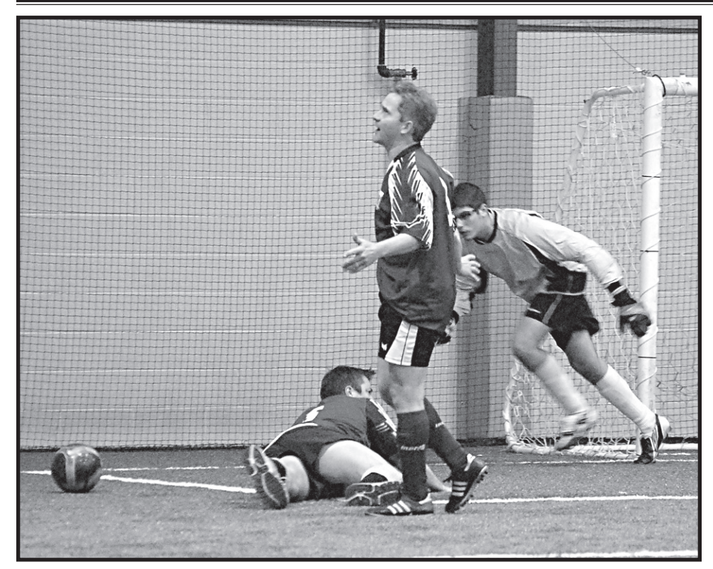
GOALATTEMPT FOILED: A defender makes a timely block on a furious attempt on goal, while the goalkeeper looks relieved, part of the recent intense action during Men's Indoor Soccer Finals at the Dufferin Centre.