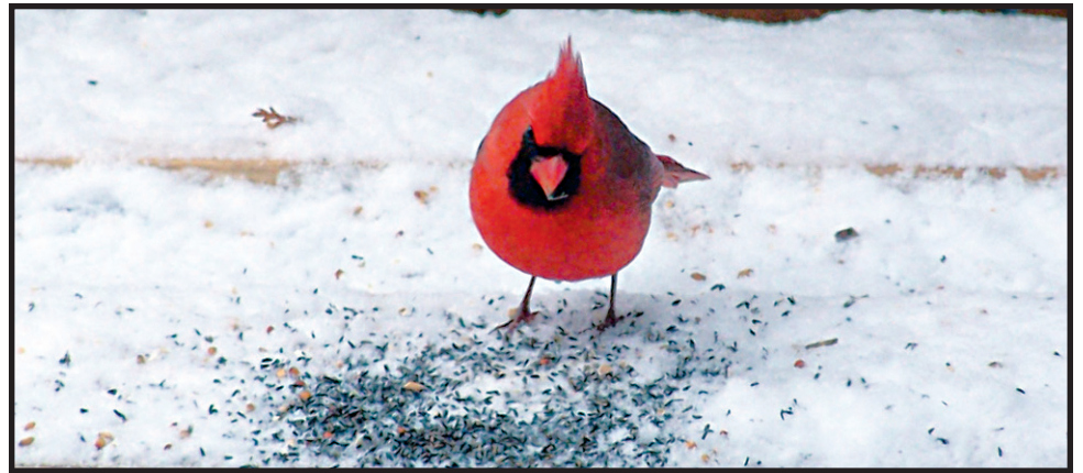
SEED SEARCH: Enjoying the sunshine and relatively mild weather, this Cardinal kept coming back for more seed at an Acton residence.

is being nominated. The award recipients will be chosen from nomination submissions of any business operating in Halton Hills or any employee of a Halton Hills business establishment. (In order for previous nominations to qualify, the nominator must contact the Chamber office, or re-submit the nomination).