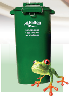
Items for GreenCart