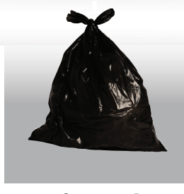
Items for Garbage