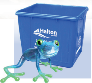
Items for Blue Box