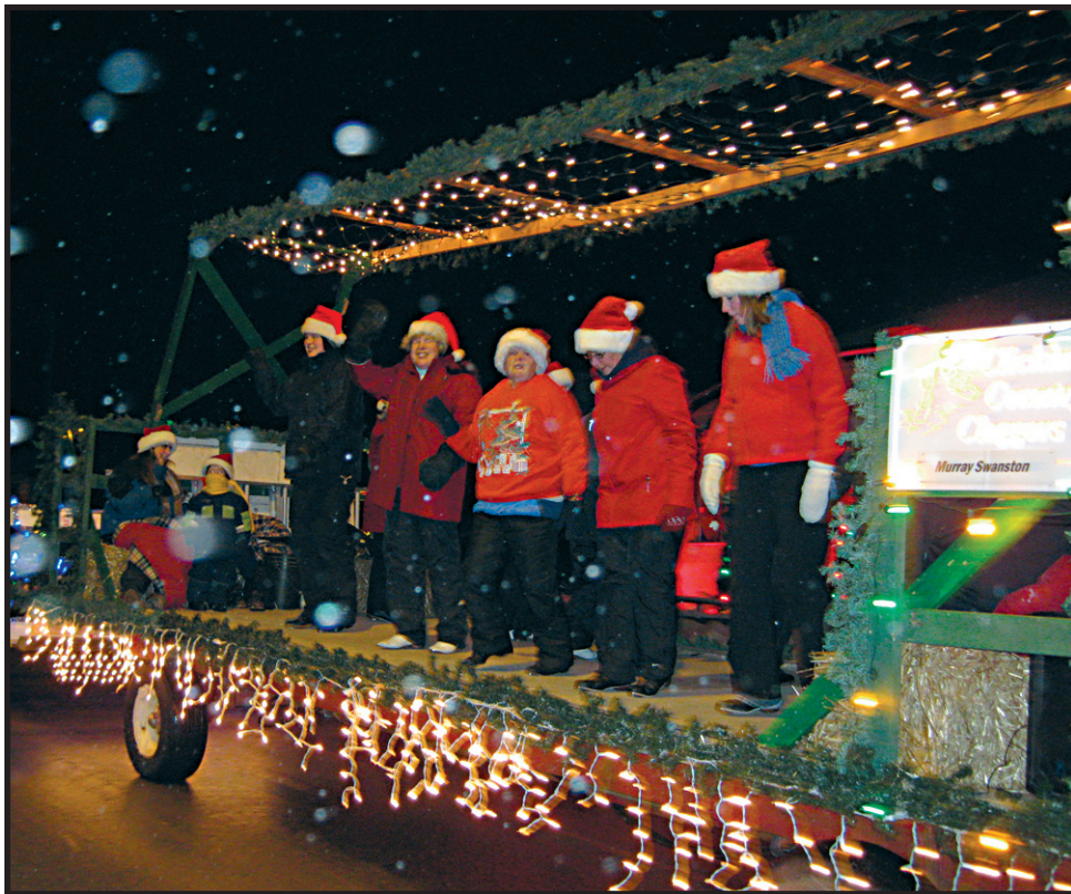
ROCKWOOD PARADE A CROWD PLEASER: Thousands of people lined the streets of Rockwood last Thursday for the 17th annual Parade of Lights that featured farm equipment festooned with Christmas decorations and holiday lights.