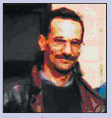
Who killed Wayne Greavette? Local Cold Case Murder highlighted. See Page 3.