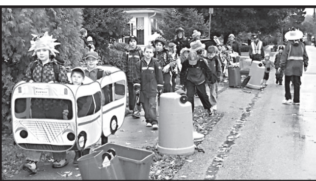
HERE COMES THE BUS: A walking school bus traveled down the sidewalk to celebrate "Walk to School Day" last month.

The Halton District School Board will launch the Active and Safe Routes to School (ASRTS) project at Falgarwood Public School today (Thursday). ASRTS engages young students in active transportation such as walking, biking, and in-line skating as a healthy, sustainable way to get back and forth to school.