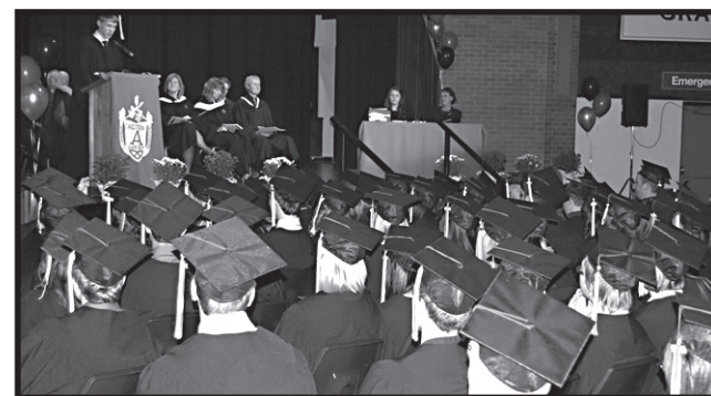
BOARD OF EDUCATION: A sea of mitre boards fronts the stage at commencement last Friday night.