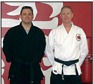
Two Acton black belts get promoted. See Page 15.