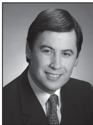
Michael Chong from Parliament Hill

We've introduced an enhanced work-sharing program, to help Canadians stay in their jobs and help companies avoid layoffs. This pro-