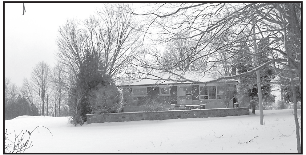
GROW OP: This house on 25 Sideroad just south west of Acton was the site recently of Halton's largest grow-op bust.

Charged with production of marijuana, possession of marijuana for the purpose of trafficking and possession of property obtained