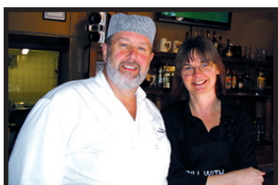
La Vielle Auberge is now "Heaven on 7" Story on page 11