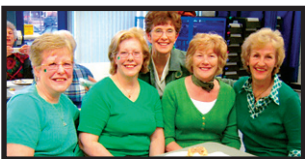
When you're a Murphy you gotta be Irish? See Seniors' Recreation column on Page 8