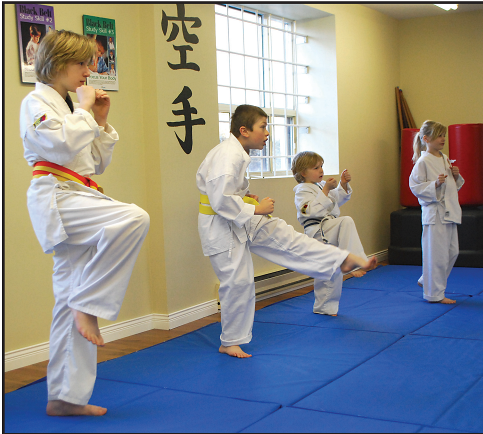
MARCH BREAK KICKS: Absolute Martial Arts held a March Break Karate Camp held each morning of the March Break. On Tuesday morning, these students were learning some kicking techniques before playing many fun games and races