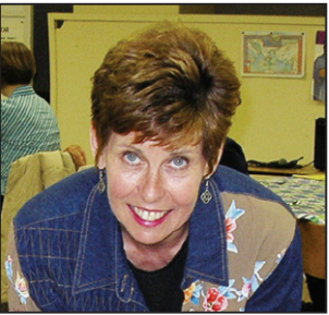
A cancer survivor knows the importance of 2009 campaign. See Page 4