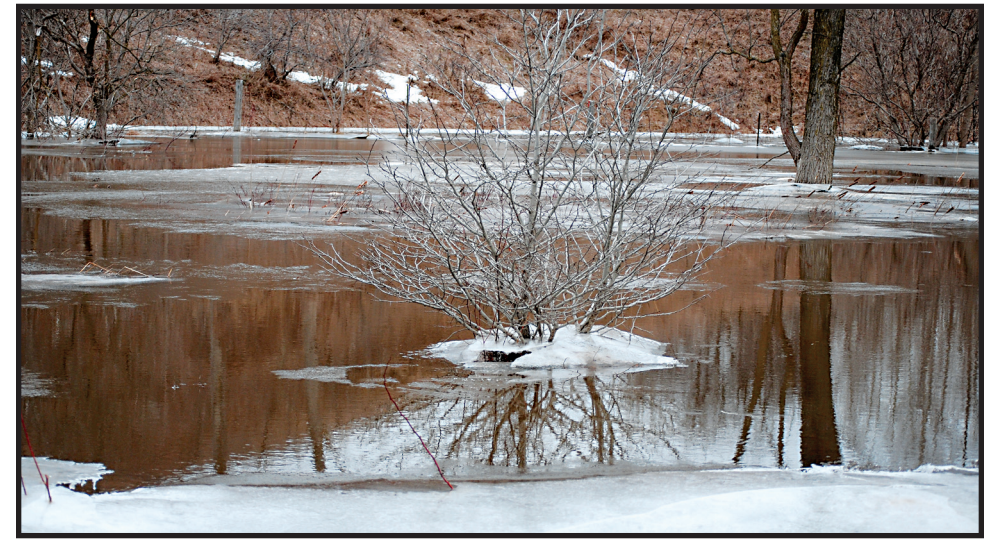
A TOTAL WASHOUT: This was the scene on Glen Lawson Road on Friday morning after the rain that hit the area last week. The melting snow and rain together caused creeks to overflow, washing away part of the road and rendering it impassable. The road was closed to all traffic including emergency vehicles.